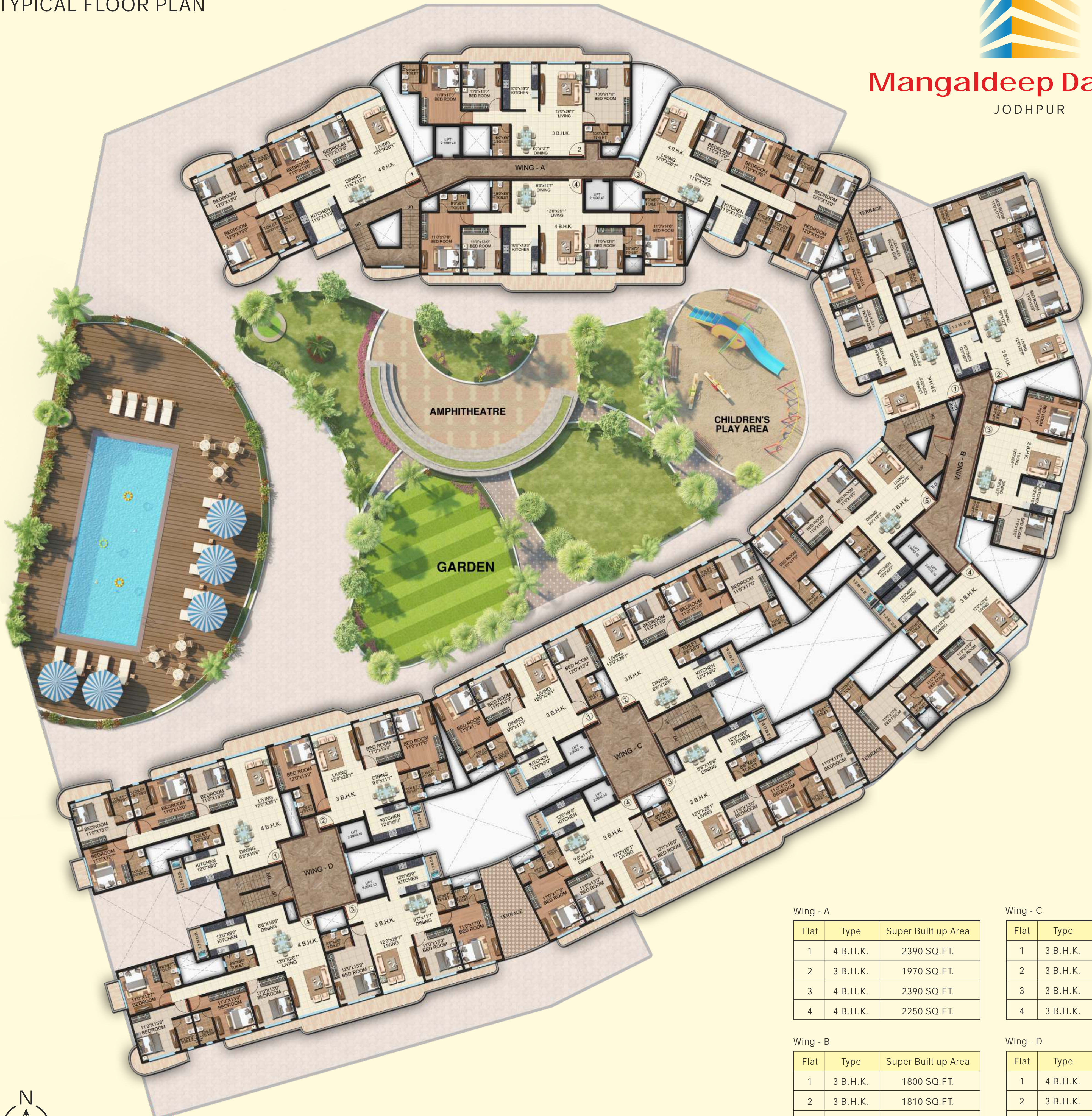
Wing - A