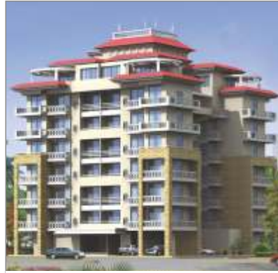
Mangaldeep Shyam Nagar