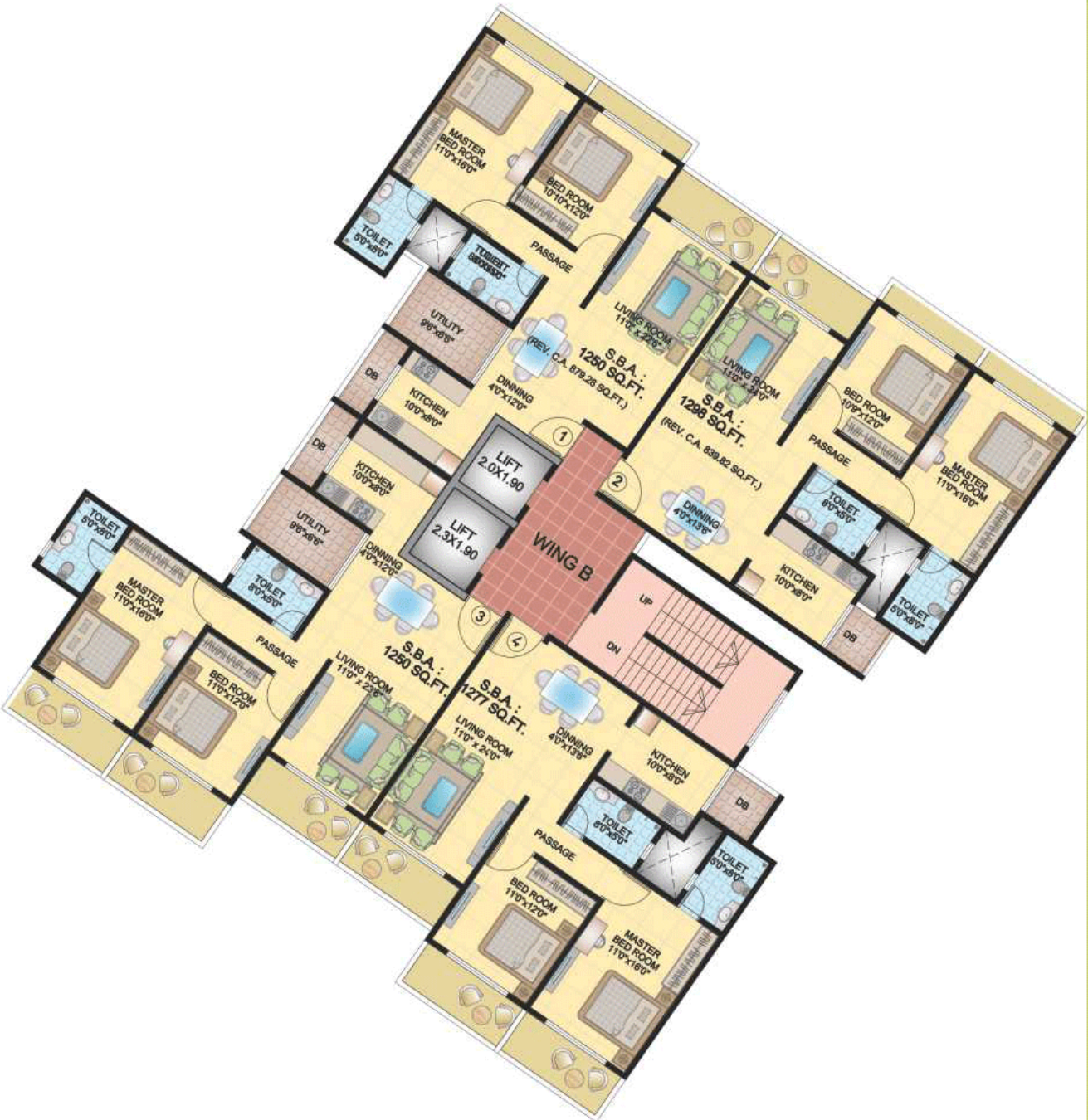
TYPICAL FLOOR PLAN OF WING 'B'