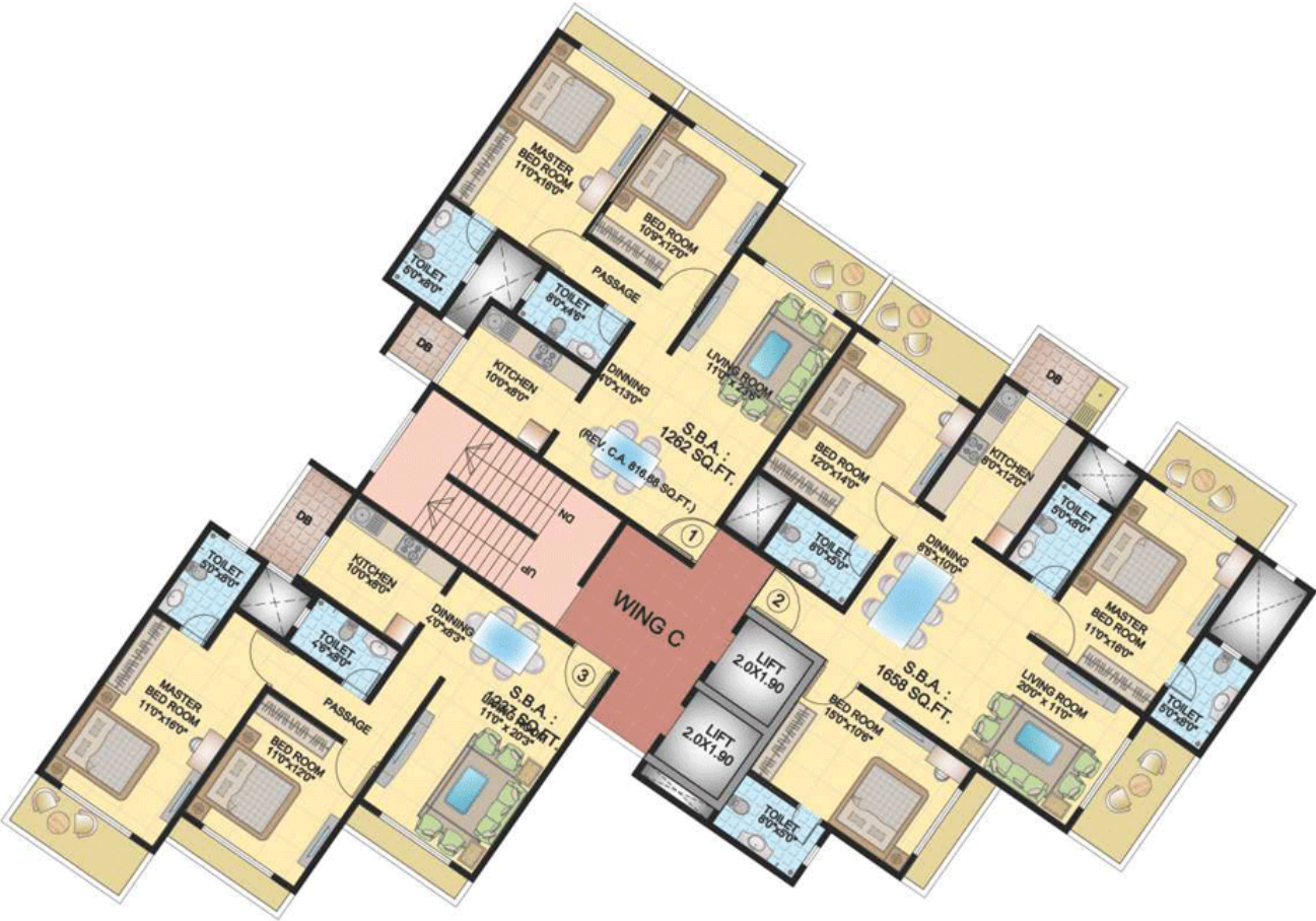
TYPICAL FLOOR PLAN OF WING 'C'